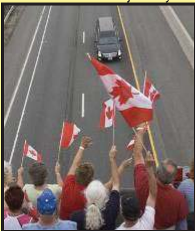
One of the many pictures from the book