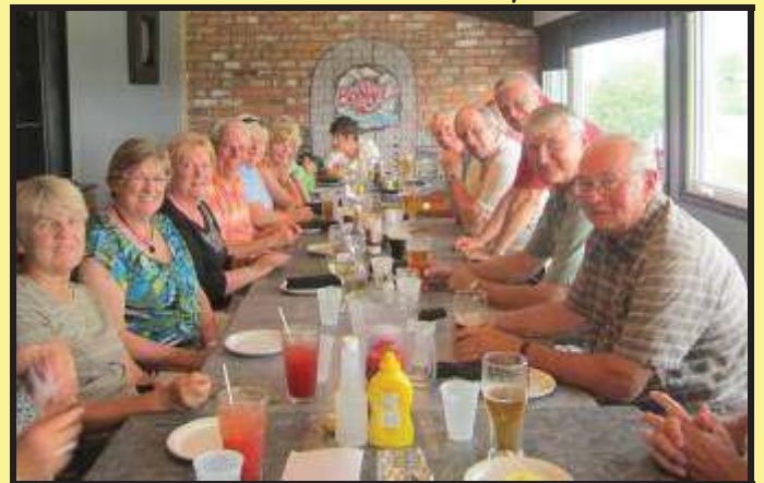
The Rowdy Table - too many to list. You know who you are!