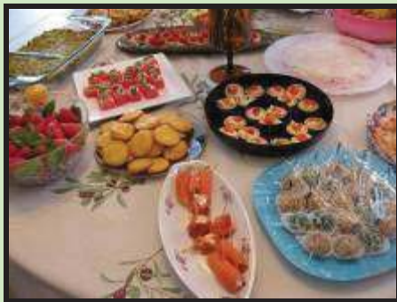
Just a few of the yummy appetizers