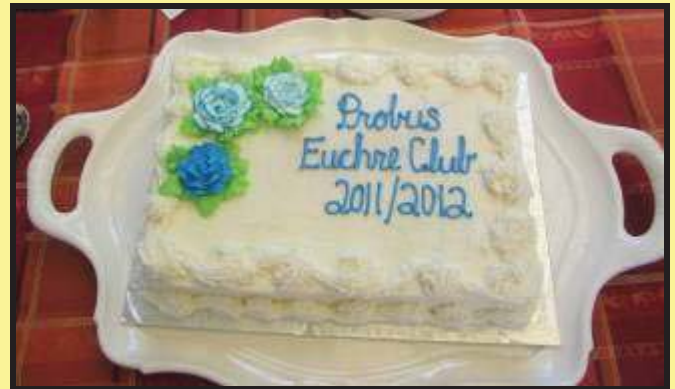
One of the yummy cakes