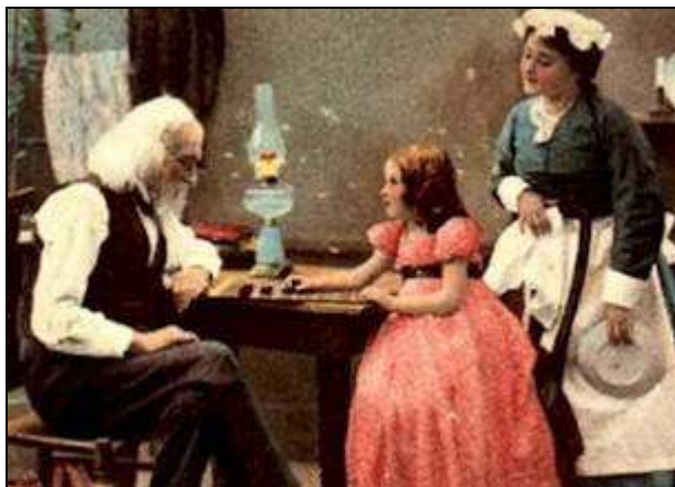
Family pastime by the light of the oil lamp