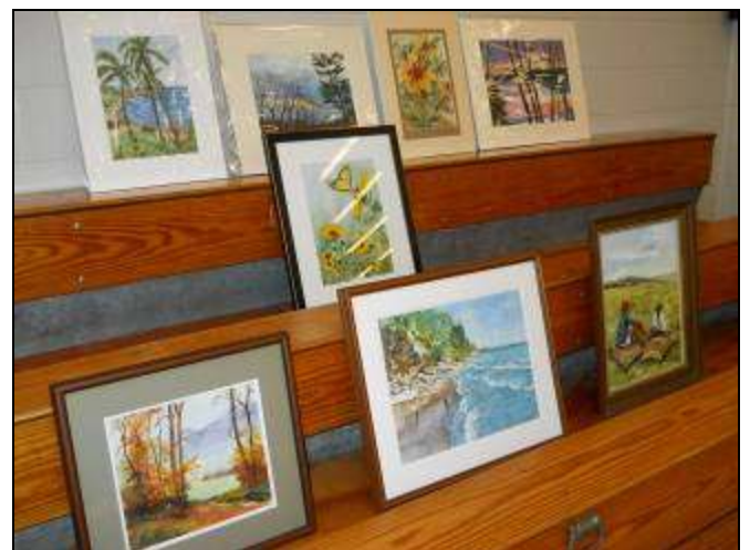
A small selection of Felicity King's paintings