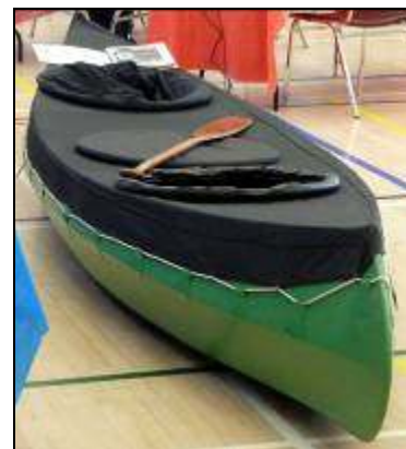
The amazing Norwegian "Ally" canoe weighing 51lbs.

Way past the tree line and 18 hours later, they arrived at their starting point...or so they thought. The mosquitoes and black flies were rife which meant they had to wear mosquito suits but the hungry flies ended up inside their garments! They then found they had to portage over huge rocks and shoot rapids to get to the Thlewiaza River. Upon arrival, they were awed by the size of this immense river. Unbeknownst to his mates, Jay had brought a bottle of single malt, some Yukon Jack and Cuban cigars! They feasted, dodged grizzly bears and encountered bad weather during their expedition on this great lake. At the end of their journey, Blake used his satellite phone to find someone to pick them up in a bush plane for the return trip to Churchill. It was quite a shock to get back to civilization after 2 and 1/2 weeks in that faraway place. They were grateful for Farley's notes which were always correct, proving he had indeed paddled No Man's Lake.