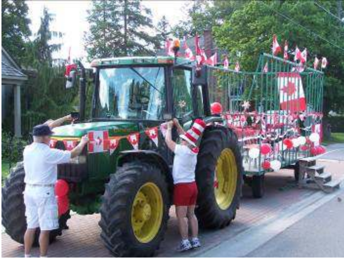
Decorating the wagon last year