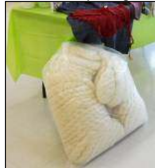
This bag contains the fleece of 1 sheep & weighs 2200gms.