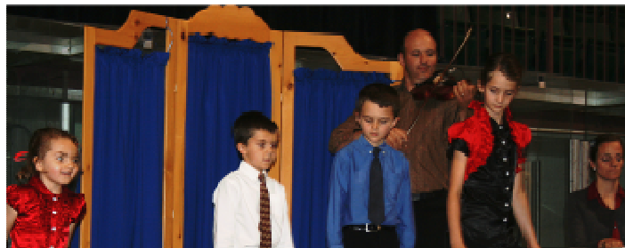
The 4 Leahy children (ages 4 to 9) and their parents

Following some prize-giving, a delicious lunch and great desserts, we were entertained in the truest sense of the word by members of the Leahy Family.