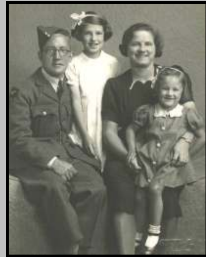
Mum & Dad and my 2 sisters around the time of this story

walking towards him but my Mum and two sisters who just happened to be out for a walk! You can only imagine the tears of joy at that reunion!