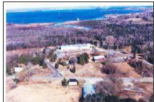
Aerial photo of Harwood Fish Hatchery

It was a most interesting presentation judging by the number of questions asked by members at the end. A visit to the hatchery will be arranged in the near future.