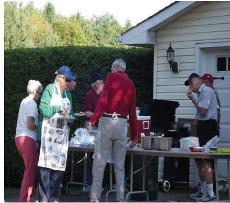
if you help you get a nice apron