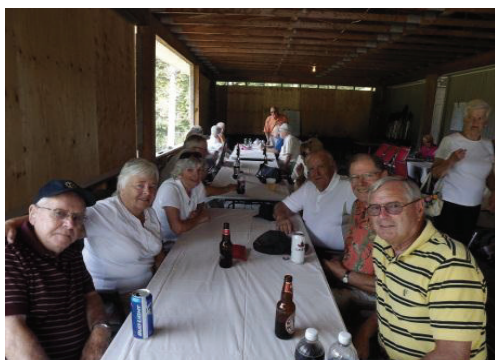
After the work and play is done