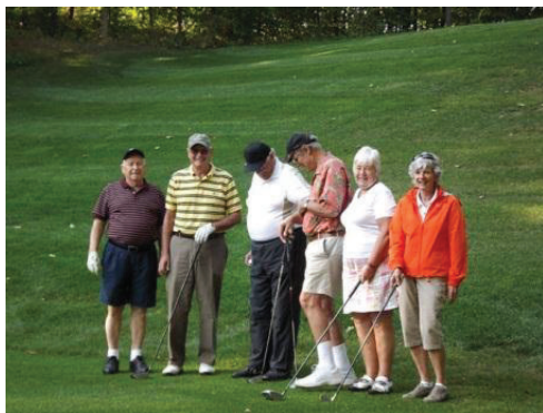
Where do we play?

Golf Tournament 2012 . There were fifty-eight (58) attendees in Northumberland Probus groups. Our 2 groups weren't the lowest score, nor the highest, but we had a lot of fun on a beautiful course.