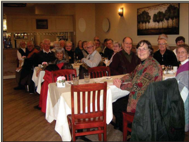
And a good time was had by all !

To succeed in life you need three things: