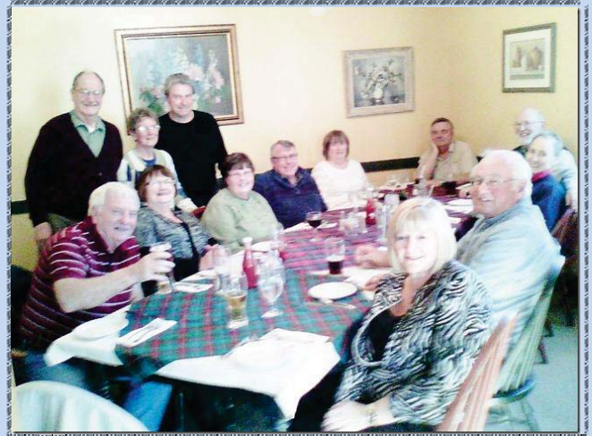
And a good time was had by all