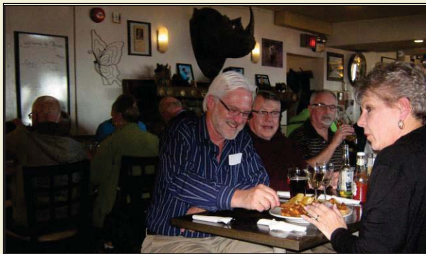
Some people just can't be trusted

It was a full house and everyone enjoyed the service, the company and the food.