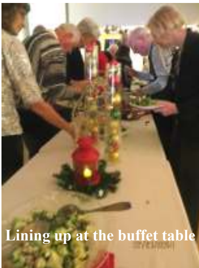
Lining up at the buffet table

the month at the Town Park Recreation Centre in Port Hope.