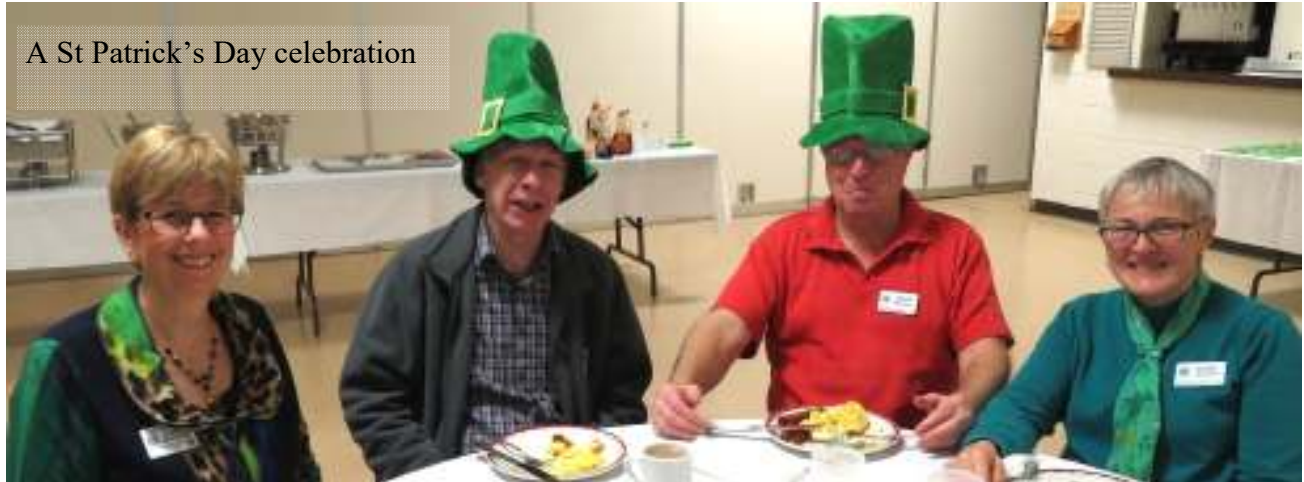
A St Patrick's Day celebration