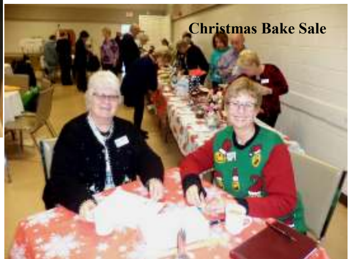
Christmas Bake Sale

Saw a donkey crossing the road. He looked both ways! What a smart ass!