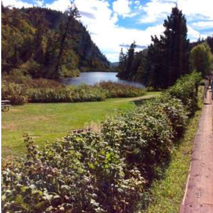
Photos from the Agawa Canyon Trip