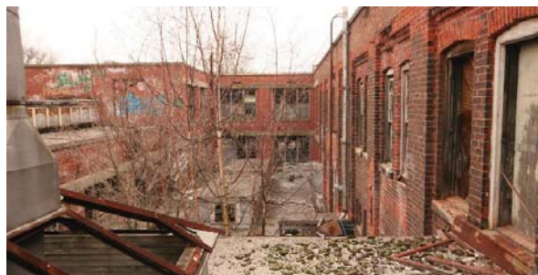
Inside the Nicholson File Factory Compound