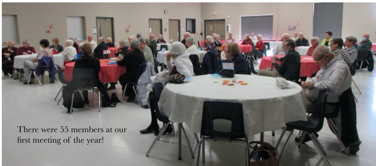
There were 55 members at our first meeting of the year!