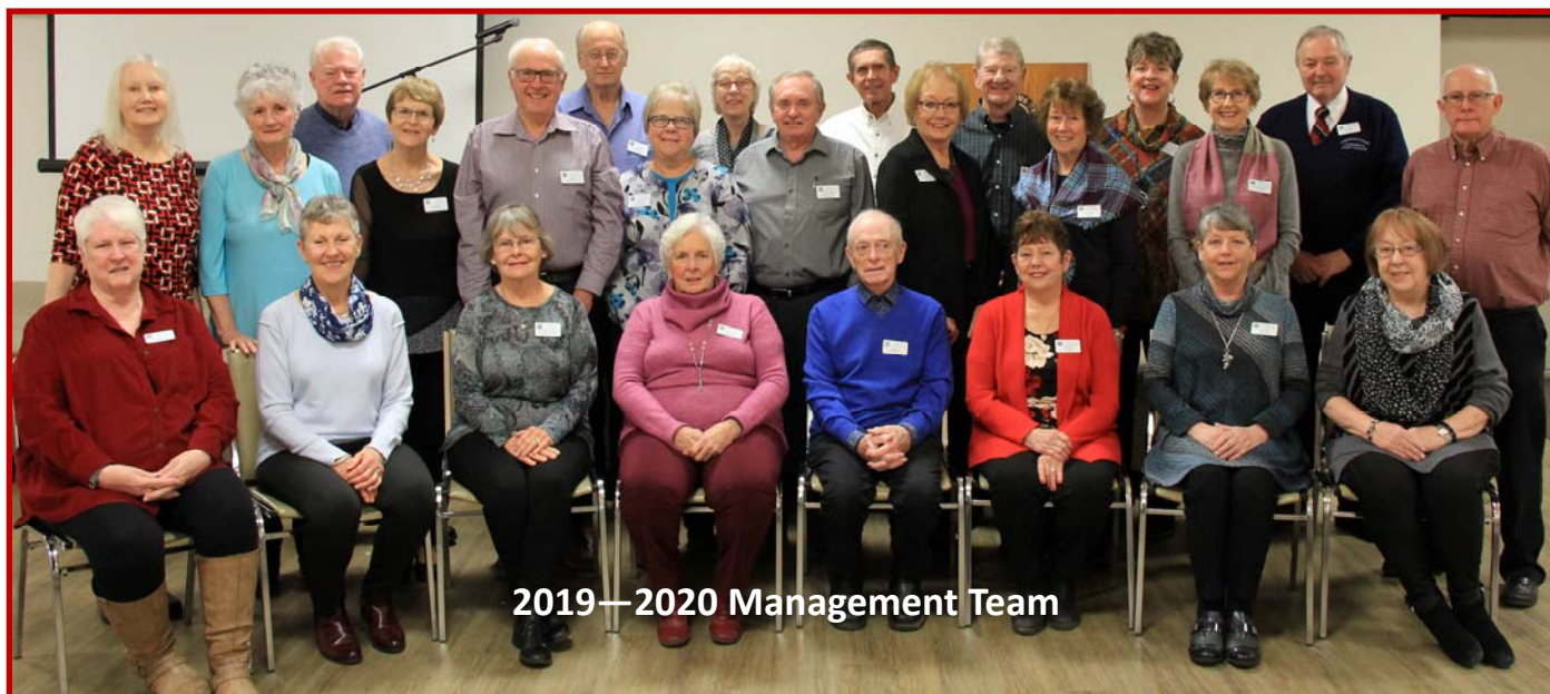
2019—2020 Management Team