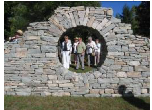
The Moon Gate at the Garden Hill site.