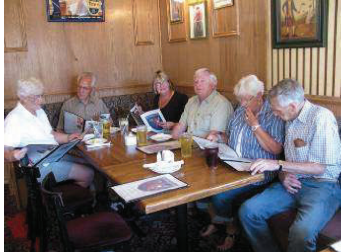
Decisions, decisions....what shall we eat??

On Tuesday, July 12 dinner was enjoyed at the Winchester Arms in Port Hope with a lot of laughs & conversation with possibly most of the world's problems being solved.