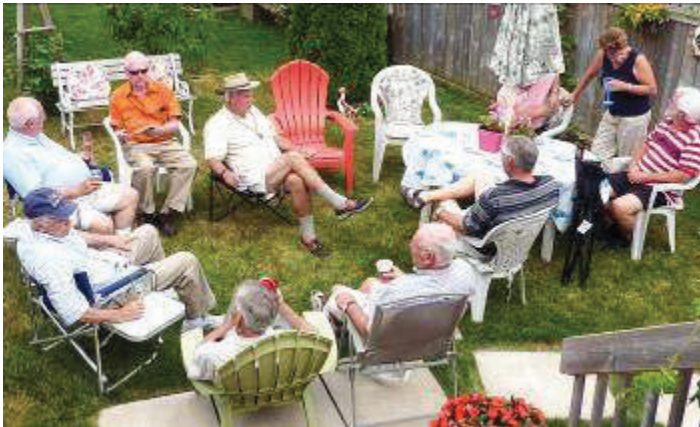
Guys shootin' the breeze.