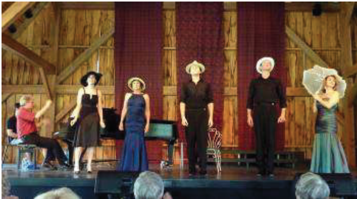
A really grand finale!

After the performance we all went to Christ Church Anglican in Campbellford for a delicious roast beef dinner prepared by the Church ladies group. Imagine our delight when we found that the church hall was air conditioned!