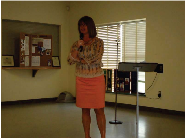
It was very interesting to learn how the Board of Directors fund the different departments in the Hospital.