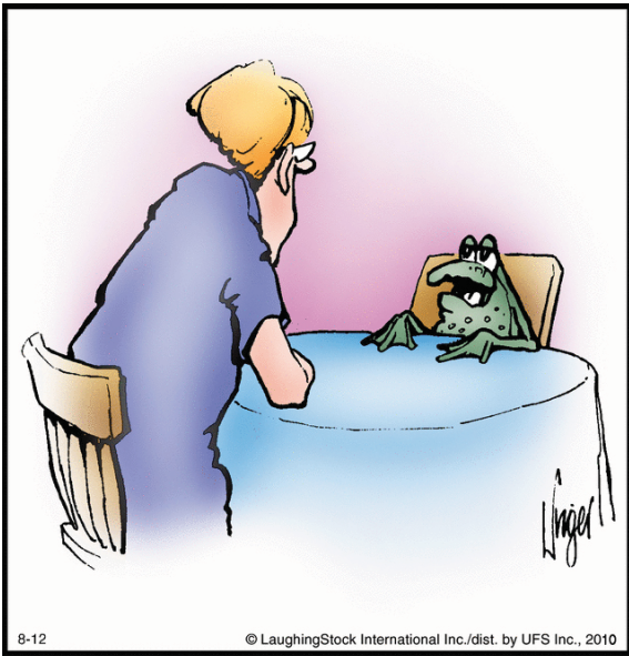
"Nothing your mother does surprises me anymore.."